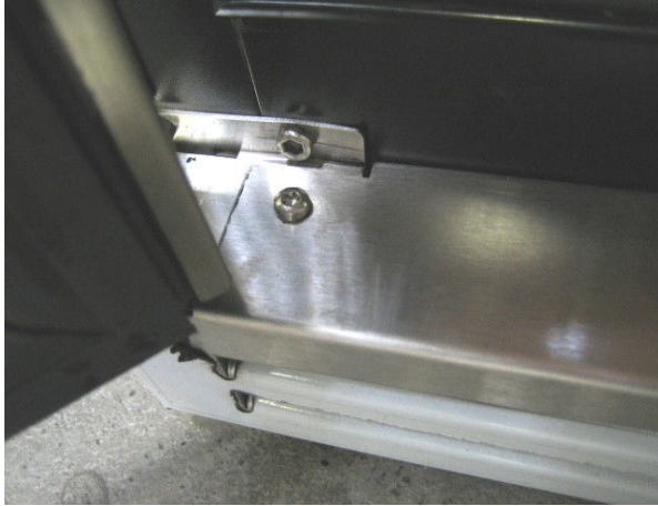
Left side Wine cooler