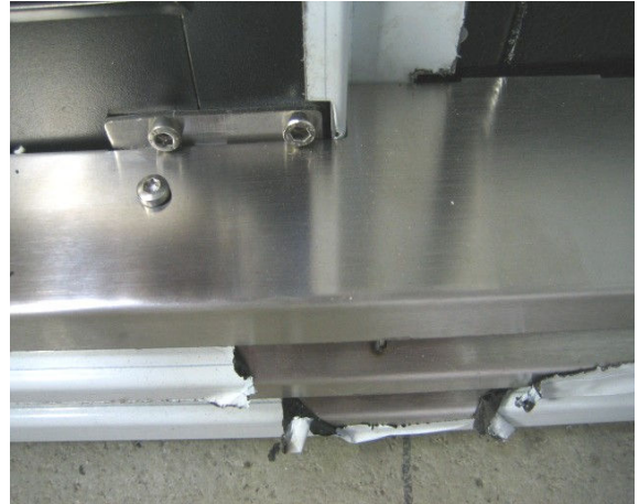
Wine cooler / Side by Side or Bottom Mount unit