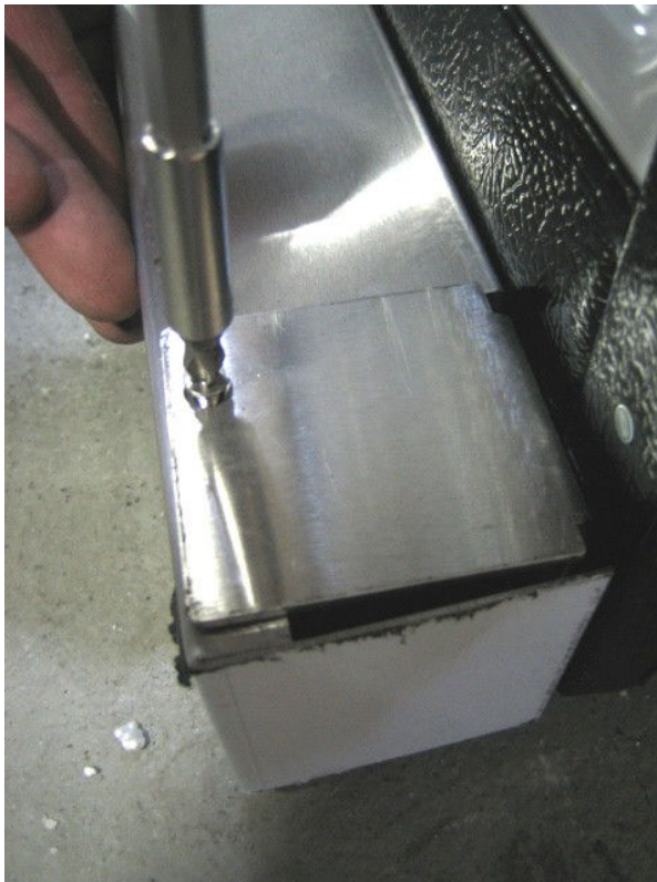
Right side For Bottom Mount unit AB.../ G3...