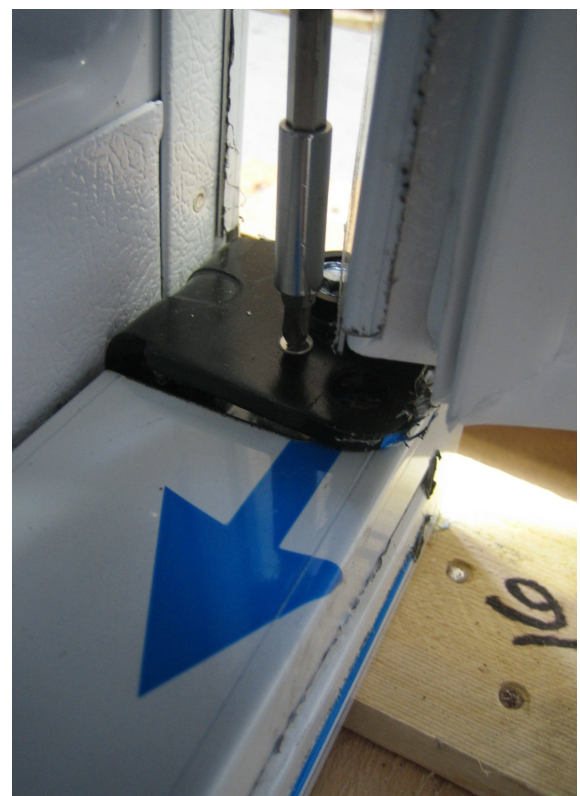
Right side For Side by Side unit AC22...